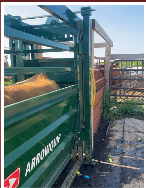
Working cattle: giving injections of estrumate and putting on heat detection patches