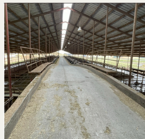
Organic Dairy where the tractor drives over cows

Alta Genetics pushed me outside of my comfort zone while showing me what the commercial side of the dairy industry looks like. I realized that companies like Alta focus more on their larger clients and prioritize the quantity of semen they sell. This is a side of the industry I would rather not be a part of. I am more comfortable with the small town dairies in eastern Iowa.