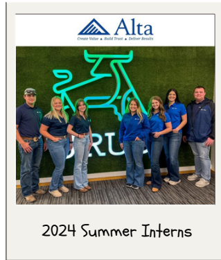
2024 Summer Interns

Be firm with what you want to do and what you are looking for in this internship. I made the mistake of trying to pander to the company to ensure I got the internship. I sacrificed a lot for something I did not end up enjoying.