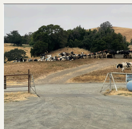
Free Range Organic Dairy Cows